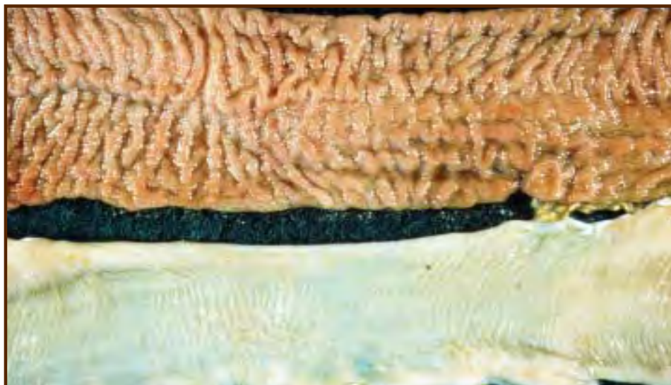
Top ileum: Inflammatory response to MAP. Bottom: Thin, pliable, normal intestine.